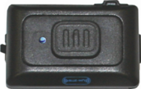
BTR REMOTE SWITCH

BLUETOOTH EARPIECE, BT RADIO ADAPTER & BTR REMOTE SWITCH