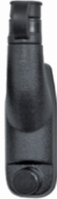
BT RADIO ADAPTER