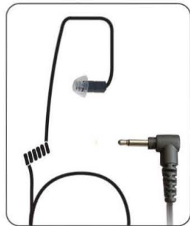
ALSO AVAILABLE IN BLACK IN 3.5MM & 2.5MM SIZES.